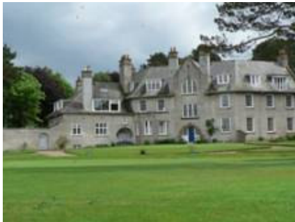
Tarland House at Nairn