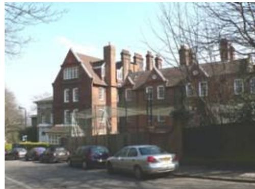
Davidson's House, Harrow School